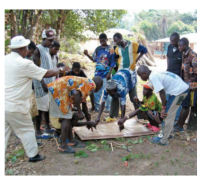
Participatory mapping is a collective action that builds mutual trust and understanding.

Integrated landscape management investment projects work best where land rights are clear and unchallenged. Land registry (cadastral) records and agreements are enforceable by law, but usually this situation is not in place. Explore alternative tenure and business arrangements with the local communities/farmers that can give adequate sustainability, equity, transparency, long term security and for protecting both the investment and the interests of local stakeholders. This should include local decision-making and a formal mandate for landscape governance, and ideally, national and local government agencies should support such participatory processes.