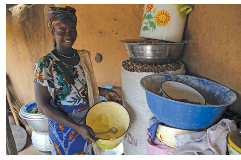
The local community including women producer groups, work with A Rocha Ghana, the Savannah Fruits Company, Form International, district assemblies and traditional authorities, and the alliance is now being expanded to include other shea value chain companies.

The company guarantees women a premium on their shea nuts, and incentivizes community action for sustainable landscape management through an organic