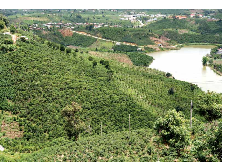
Any investment will have impacts beyond the area to be invested in.

Investments in agriculture and forestry cannot be seen in isolation from wider land use dynamics. There are interactions and trade-offs at all levels – ecological, social, cultural, economic, and political – and competing claims and interests between various land uses and land users. Any investment will have impacts beyond the area to be invested in, and understanding this is essential to mitigate risk, and ensure that the investment produces the anticipated socio-economic and ecological benefits.