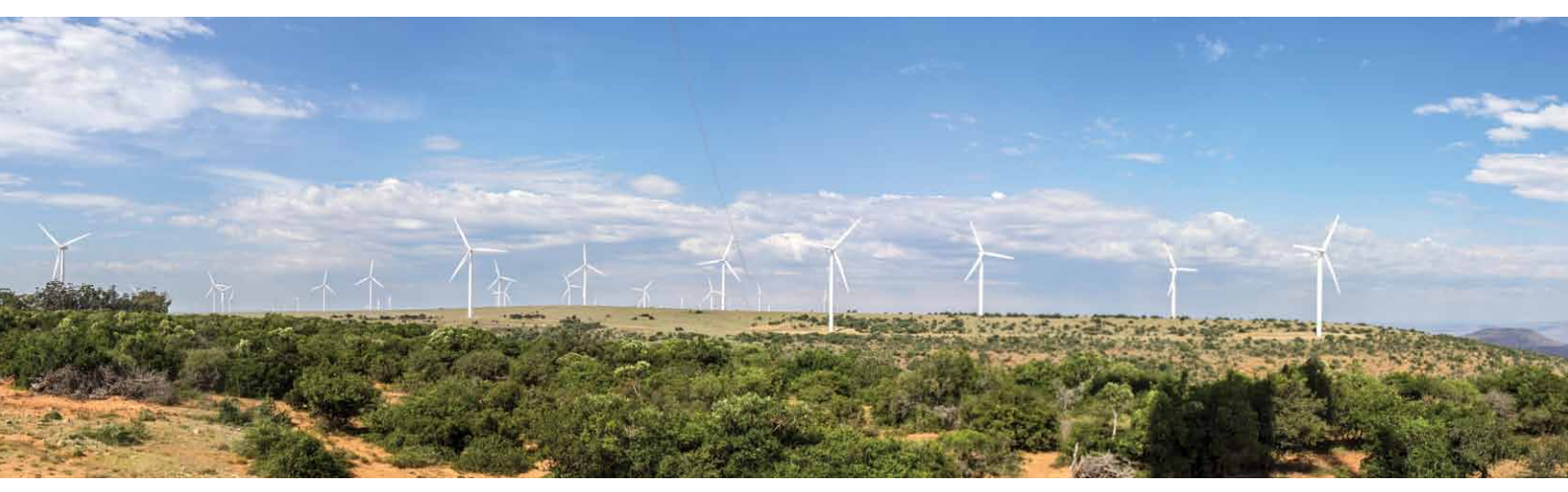
A public-private trust aggregates net dividends received through private investment in this windfarm to support public projects and activities that benefit the community as a whole (see Case 5: Cookhouse Wind Farm).