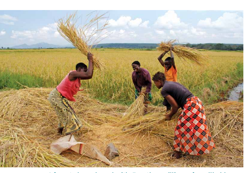
A force to be reckoned with. Together, millions of smallholder farmers produce three quarters of all the world's food.

Working with smallholders and local communities is increasingly seen as an opportunity instead of a challenge, but this requires a shift in skills and mind-set by investors, and how they do business, perceive risk and 'engage'. Working with smallholders has very many advantages. The first, of course, is that investors do not need to organize or employ staff– and the smallholders will do what they do best – grow crops. And issues of scale are easily reached if investors think big – even if they only farm one hectare each, 1000 smallholders x 1 hectare = 1 x 1000 ha investment.